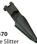
82000470 1" Water Line Slitter